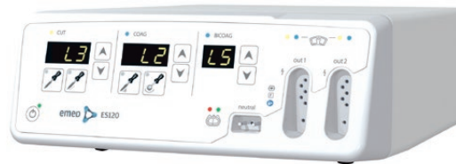
100-015 Electrosurgical unit ES 120